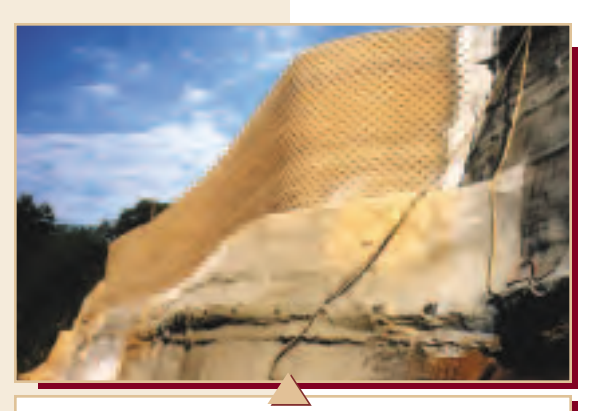
View of wall with soil nailed "bench" below.

Conventional fill, such as sand, would have cost about $5 per cubic yard placed, while the cost of the lightweight aggregate solution was approximately $30 per cubic yard placed. This lightweight material was needed to solve the problem due to the inability of the underlying wall to carry the load of the conventional fill. Combining these various stabilization systems was an economical and yet ideal solution.